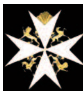
Star of a Bailiff Grand Cross of the Most Venerable Order of the Hospital of St. John of Jerusalem.

The Order of St. John is one of five National Orders in the Canadian Honours System which also includes the Order of Canada, the Order of Military Merit, the Order of Merit of the Police Forces and the Royal Victorian Order.